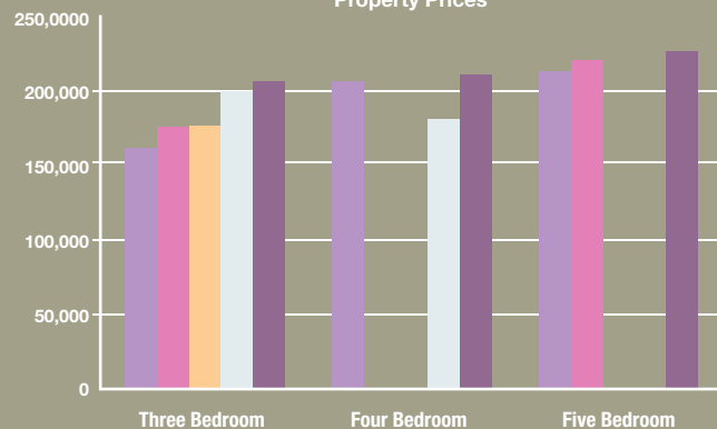
Fig 3: Comparable Development Property Prices

Note: Some developments do not have a full range of similar properties to Avonmore Court therefore are shown with no value